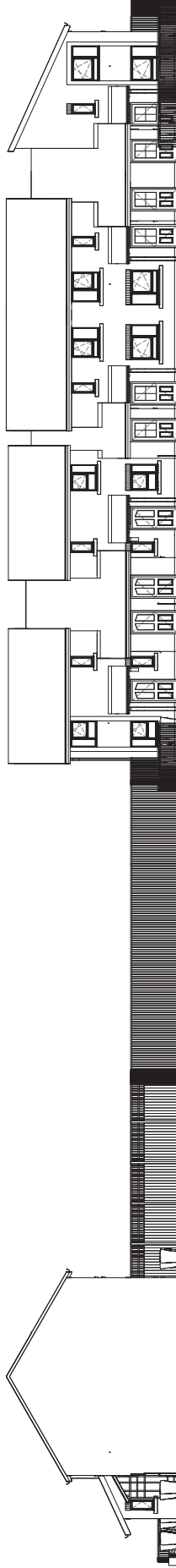
2 West Block Elevation